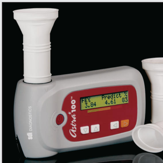
The AstraGuard Bacterial/Viral Filter is designed for all Astra Spirometers.

This easy-to-use disposable mouthpiece incorporates a highly efficient filter that virtually eliminates cross-contamination from patient to patient and from patient to health care professional.